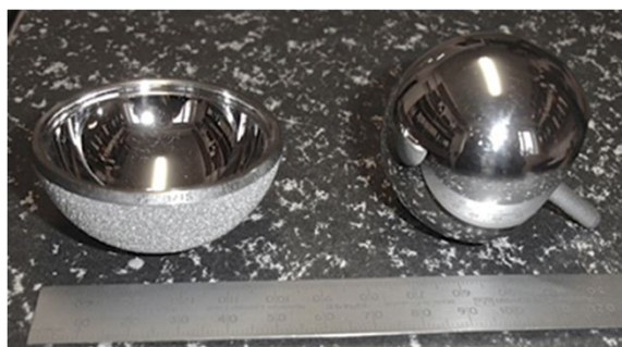
Figure 1 DePuy ASR™ resurfacing hip (note the small femoral stem right). To the left is the acetabular cup and to the right is the single-piece femoral component.

Whilst total hip replacement has had considerable positive outcomes for patients, in some cases medical implants have caused unexpected results detrimental to their desired effect. Such adverse events raised awareness of inadequacies not only of device development and testing, but also of device governance (Freemantle 2011; Riordan et al. 1998; Sedrakyan 2012). In addition, it has been argued that new and innovative designs of hip and knee implants show no benefits over older designs (Nieuwenhuijse et al. 2014). Implants require particular care as they act in vivo and can have considerable impact on the surrounding tissue and wider metabolism. In considering shortfalls in the testing, use and governance of MoM hip implants we are reminded of similar issues which have arisen over the past two decades (cf. Anderson et al. 2007; Faulkner 2009) including: the 3M™ Capital™ hip (Muirhead-Allwood 1998; The Royal College of Surgeons of England 2001) and the Sulzer Hip system failures (Stephens et al. 2006). Despite these significant events the modes of governance of medical implants – professional, notifying and regulatory – were again shown to be lacking by the recent global