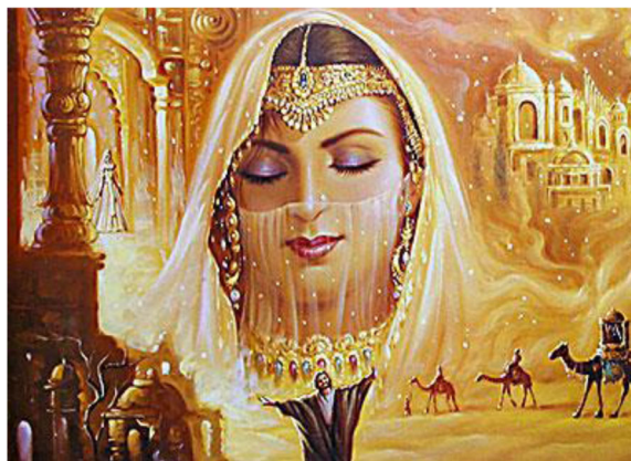
Fig. 2 Tragic love story of Laila and Majnu

When Qays heard of her marriage he was heartbroken. He fled the tribe camp and wandered in the surrounding desert. His family eventually gave up on his return and left food for him in the wilderness. He could sometimes be seen reciting poetry to himself or writing Laila's name in the sand with a stick. Day and night, he pined for her. Laila was no better. Separated from Qays, she was shattered in mind, body and spirit. Not long afterwards, in 688 AD, she moved to Iraq with her husband, where she fell ill