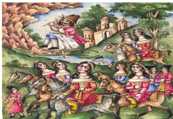
Fig. 3 Tragic Love Story of Shirin and Farhad

The Semitic romances of Shirin and Farhad, Laila and Majnun on their migration from Arabia and Persia, with the advent of the Muslims in India, have spread all over the Indian subcontinent. Besides being immensely popular in the respective places of